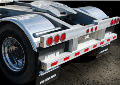
B-train lead trailer aluminum rear end.