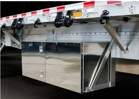
Optional tool boxes and dunnage racks can be mounted on either side and come in a variety of sizes and styles for both flatbeds and drop decks.