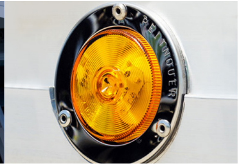
Corrosion resistant recessed LED lighting.