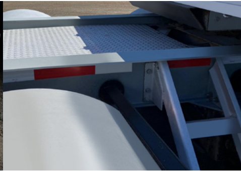
Optional easy access steps to the bridge.