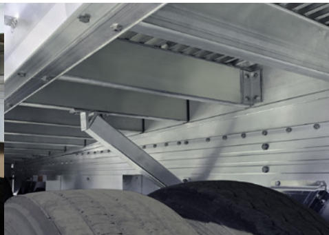
Three-piece outside cross members can be added over tires for an easier blowout repair.